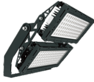
500 W / 600 W