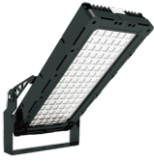
240 W / 300 W