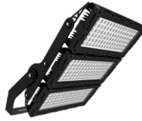
720 W / 1000 W